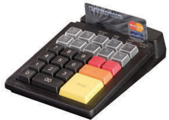
MCI 30 with MSR and Customized color keys

Ideal for high volume scanning operations where the keyboard is used primarily for tendering and PLUs. Use of double and quad keys makes this a very intuitive, uncluttered design for both new and experienced cashiers.